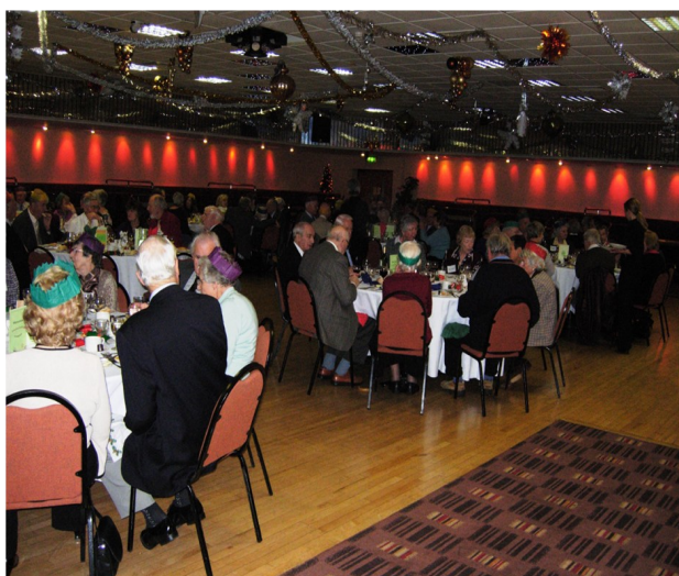
giving us a snapshot of members at our 2010 Christmas Lunch in BAWA's ballroom.

216 (G-OAF). What a sorry sight it is now. I thought it was to be moved to the hangar scheduled 'for essential maintenance'. I wonder?