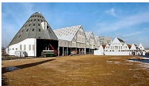
Chatham Dockyard Big Space

Our outing on Tuesday was to Chatham Dockyard. Starting in the 'big space' – a gigantic building where Victory, Nelsons flagship was laid down in 1759. Boats, lifeboats, cruisers, submarines are well displayed and many are open for boarding. Most of the morning was spent here. A quick cup of coffee before moving on to the other attractions. The museum building held an exhibition of Stanley Spencer paintings and sketches. These showed some of the activities and characters employed around shipyards while another room contained models of ships built in the dockyard.